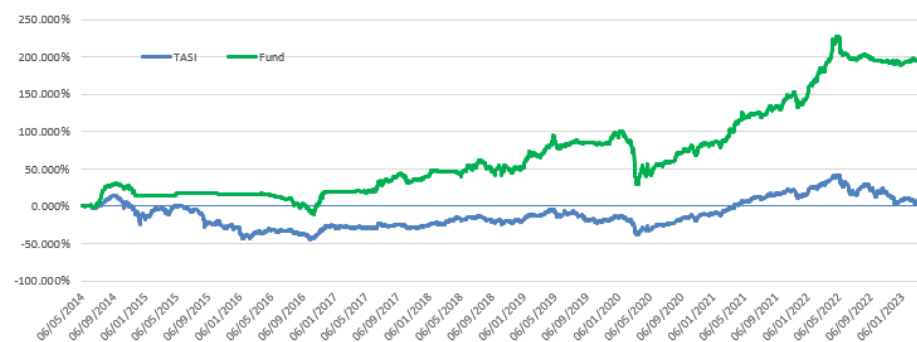
Chart showing performance since inception of the fund